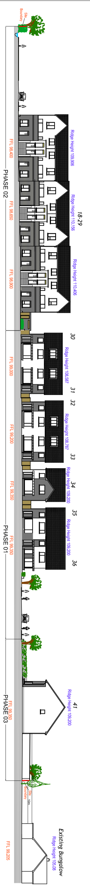
Site Long Section 3 (Units 18-36 Inclusive, Unit 41)